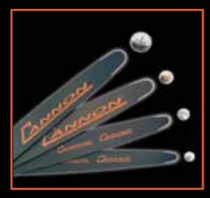
CANNON CARVER BARS FOR CHAINSAW CARVING AND TREE SERVICE AVAILABLE IN LENGTHS 8" UP TO 28"