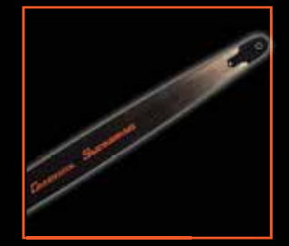
CANNON SUPERBAR Heavy-duty chainsaw bar for professional use available in lengths of 12" up to 84"