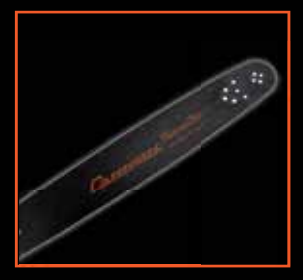
CANNON SUPERMINI NARROW-KERF CHAINSAW BAR FOR CHAINSAWS UNDER 60 CC Available in Lengths 12" up to 32"